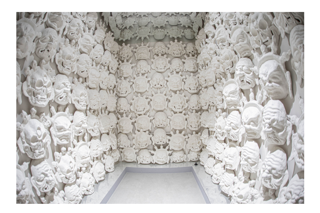
Kennedy Cottrell I Courtesy of Meow Wolf